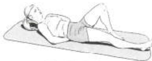
Figure 1 Trunk curl-up.