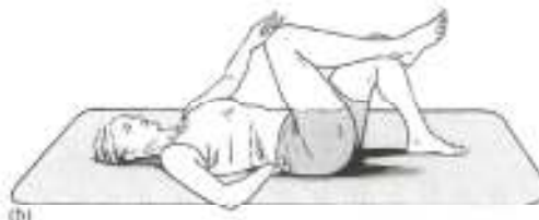
Figure 2 Dead bug (beginner).